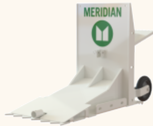
Archer 1200 Barriers (28 units)

All crash-rated, reusable, and deployable without heavy equipment