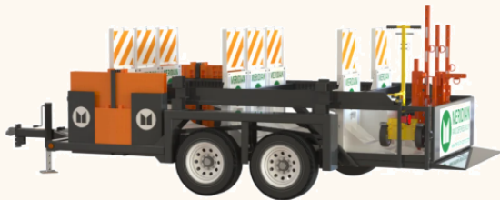
Drop Deck Trailers (2 units)